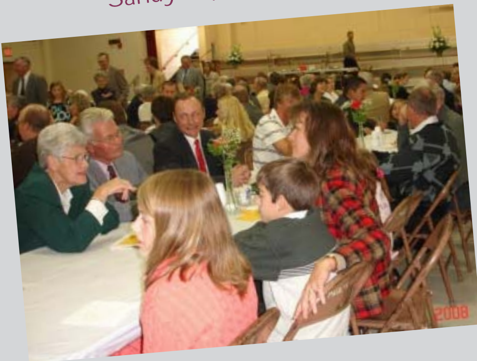
Good times, good food... aah, the memories!