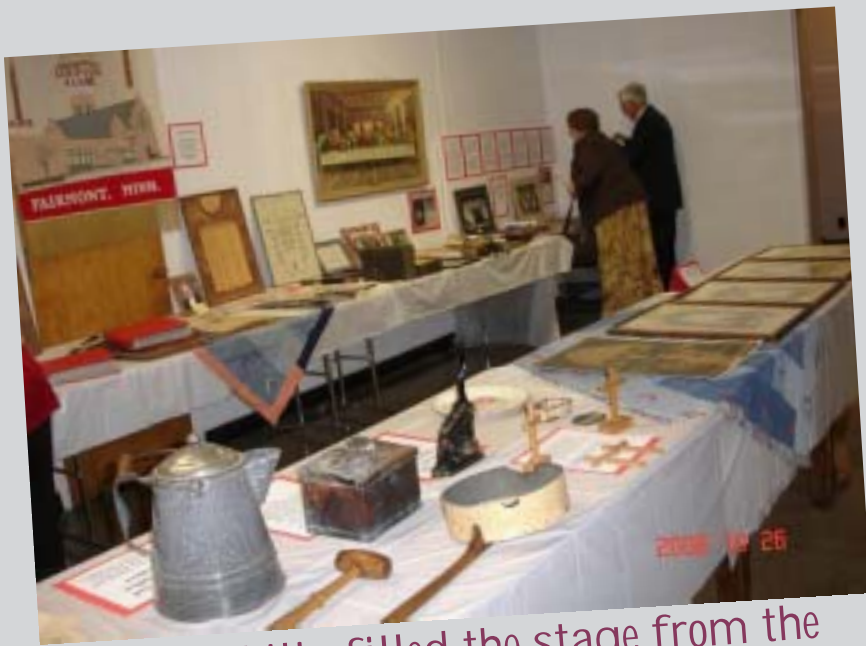
Memorabilia filled the stage from the history of the church's past 125 years